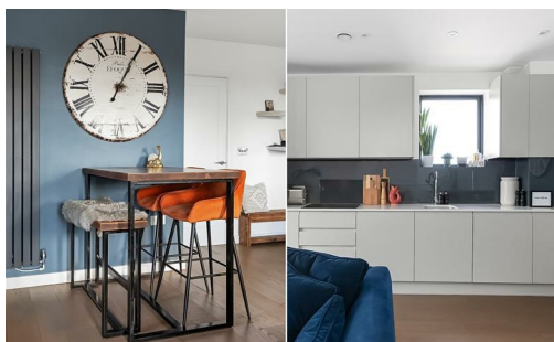
Smitham Court, CR5 Approximate Gross Internal Area 76.4 sq m / 812 sq ft